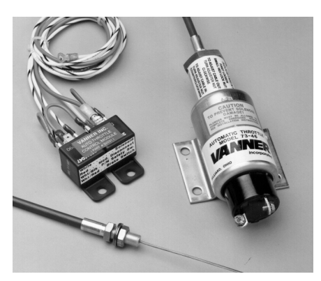
Heavy Duty Auto Throttle System Model 73-46

The 73-48 Installation Kit consists of an ON/OFF toggle switch, 02264 isolation diode, fuse, and fuse holder.