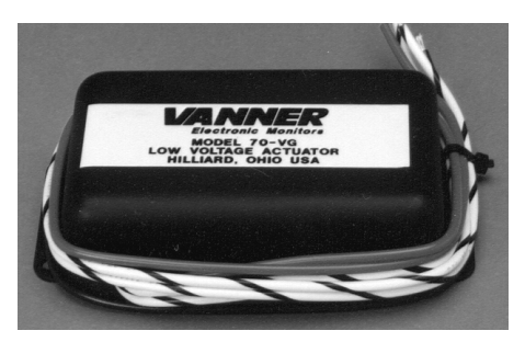
Volt Guard Low Voltage Actuator Model 70-VG

When your battery is fully charged the Volt Guard allows the engine to idle until the voltage drops to 12.5 volts. It then automatically activates the Auto Throttle until the battery has reached approximately 13.8 volts at which time the throttle is released after approximately 90 seconds. The Volt Guard automatically repeats this process as often as necessary.