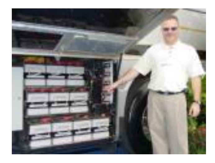
Figure 2. A 1Ton AGM battery for auxiliary loads

Even if the application has 1200lbs of batteries the 8kWHrs we take out each night has to be put back so to put it back during an 8Hr run will require and extra 100 Amps or more from the alternator, and that will be very difficult to find from a conventional device.