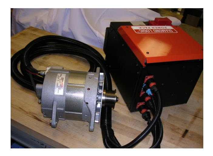
Figure 1. A 4kW Dynamic inverter system for a work truck

There are numerous solutions for adding electrical loads to vehicles. For smaller loads, simply tapping into the vehicle 12V system is adequate, although there is always the concern about a dead battery if the loads are operated without the vehicle running. For slightly higher loads an upgraded alternator and more battery storage are common solutions, often with an inverter to provide the ubiquitous power interface. The caution is that as loads increase the impact of the loads becomes significant and the integration of the auxiliary power system becomes critical to vehicle integrity. To alleviate this issue at higher loads sometimes "Dynamic inverters" are used in place of the "Static inverters". Dynamic inverters only draw power from a dedicated alternator so they do not impact the vehicle electrical system as much but they can be more complex to integrate mechanically, of course a bank of batteries can also be a problem to install and maintain so a static inverter, drawing its power from the battery bank, can be a bigger problem if extended run times are required. Although sometimes the ability of a static inverter to be used while the vehicle is moving can be an advantage, since most dynamic inverters require throttle manipulation.